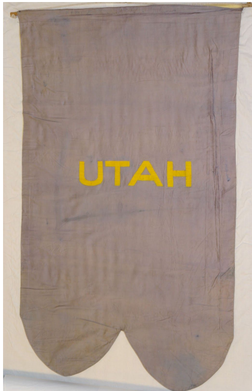
Utah state banner, 1913.