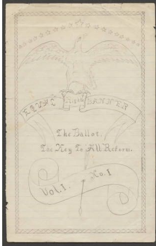
The cover of the first issue of the handwritten newsletter of the Beaver County Woman's Suffrage Association. It contains the subtitle: "The Ballot--The Key to All Reform."