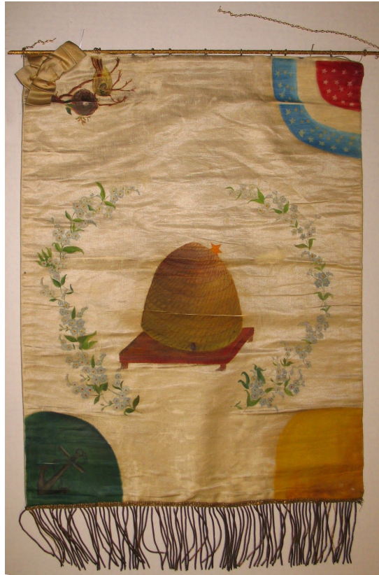
Banner for Utah Woman Suffrage Association, 1893.