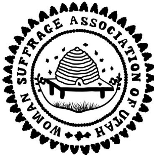
This stamp maker was used to stamp official documents and correspondence for the Woman Suffrage Association of Utah.